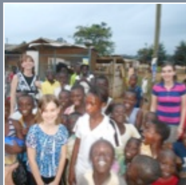
Visiting with some children after Good News Club