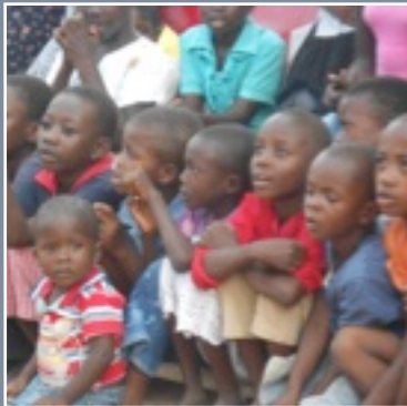
Children at a neighborhood Good News Club.