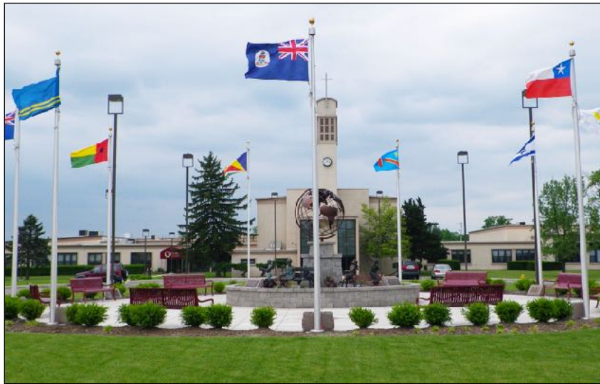
CEF International Headquarters in Warrenton, Missouri.