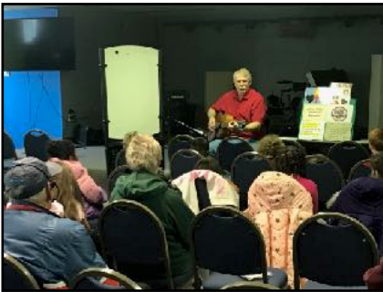
A Kindergarten club singing with their teacher

School clubs have now ended, and we want to thank every person who made these clubs possible. To keep clubs going this year, we had about 70 teachers, 100 helpers, 10 shepherds, and 10 bus drivers for a total of nearly 200 volunteers overseeing clubs in 27 schools, 4 churches, several private schools, and community locations. Many of the volunteers listed above help in more than one club.