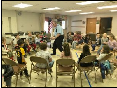
2nd graders in Waynesboro playing a game.

We are so thankful to every volunteer who gave of their time and talents, and showed the love of Christ to the children we are blessed to teach each week. We had teachers who were committed to teach in spite of medical and physical limitations. We had others who went to work early or stayed late to have time off for club. Some sacrificed financially to provide special items for their clubs. Each was a blessing from God.