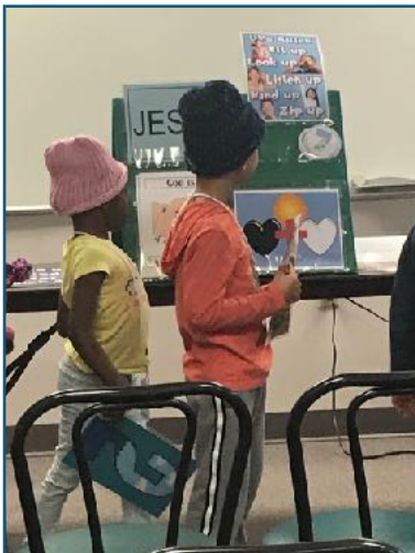
Two children pay close attention to the teacher while holding a song at a Good News Club in Chambersburg.